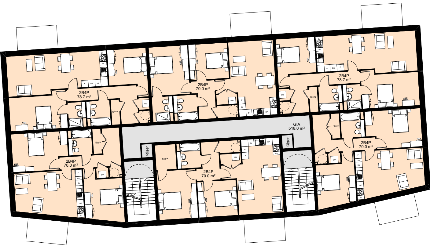
Apartments First and Second Floor Plan @ 1:200