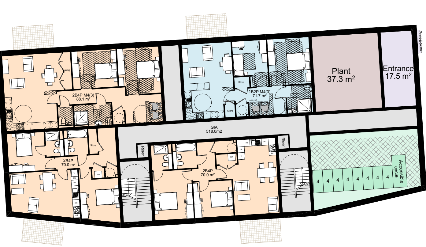
Apartments Ground Floor Plan @ 1:200