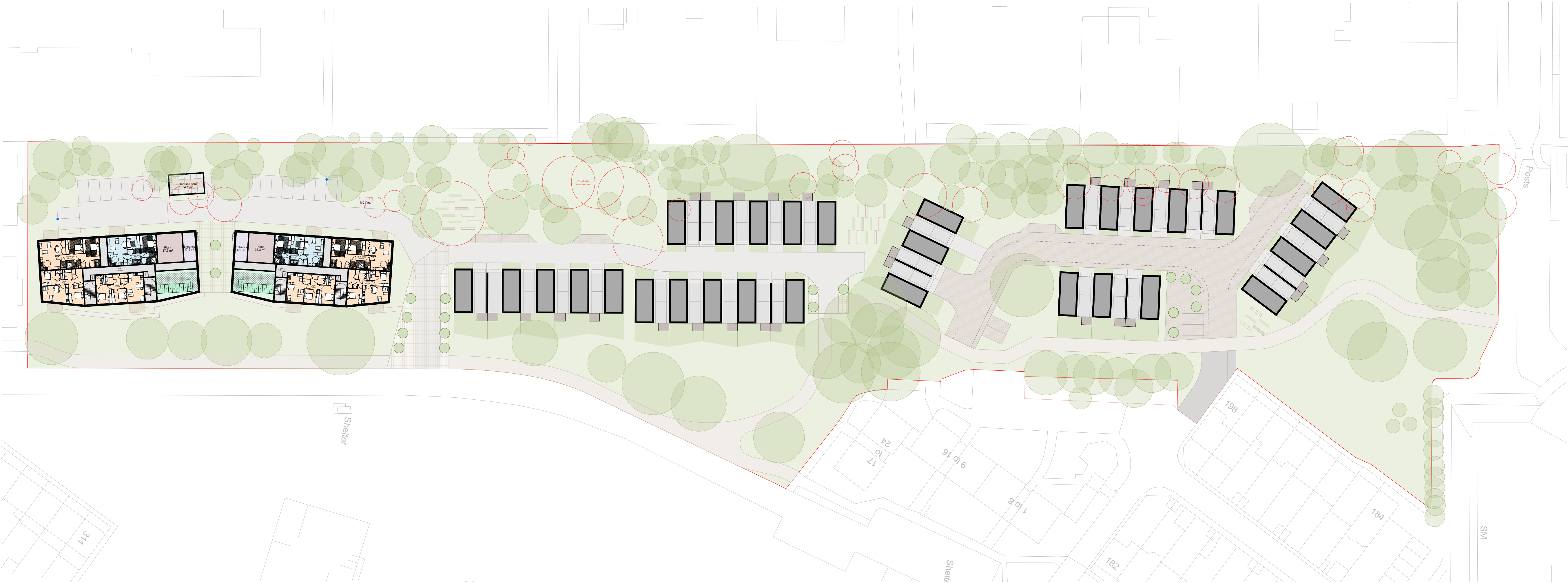
Ground Floor Site Plan @ 1:500